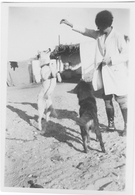
[ 📷 ] Anticipation Iswid has a tit bit & Wip-wat waits his turn

(Telox) 3 (Telox) 4 Wip-wat & Iswid (Sardic's black dog) 121 (Telox)